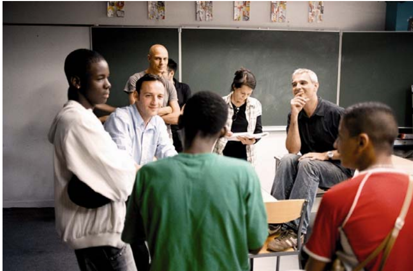
(François Bégaudeau, left, Laurent Cantet, right)